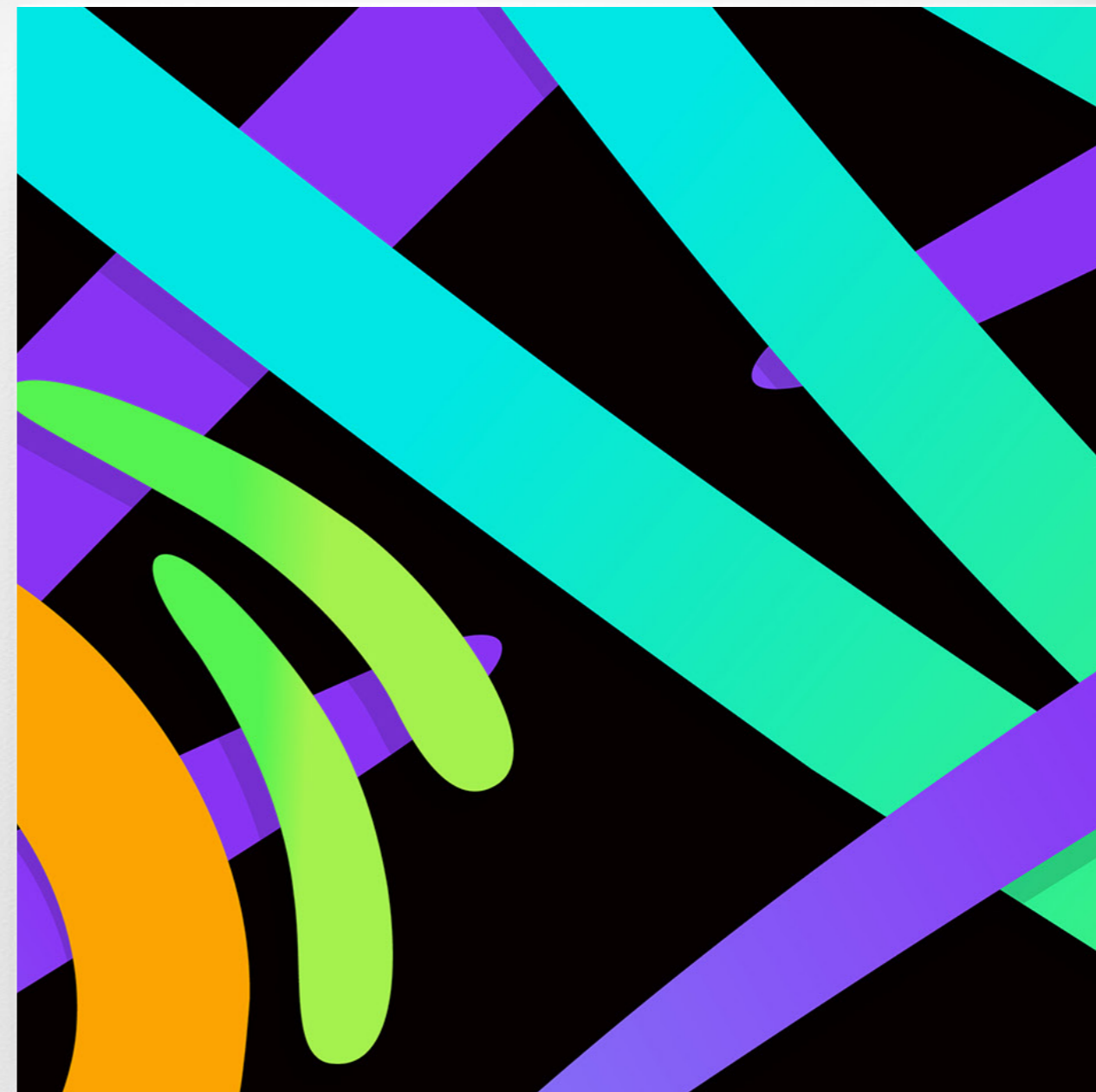
Private Commission Spray Paint on Perspex 100cm x 100cm 2022