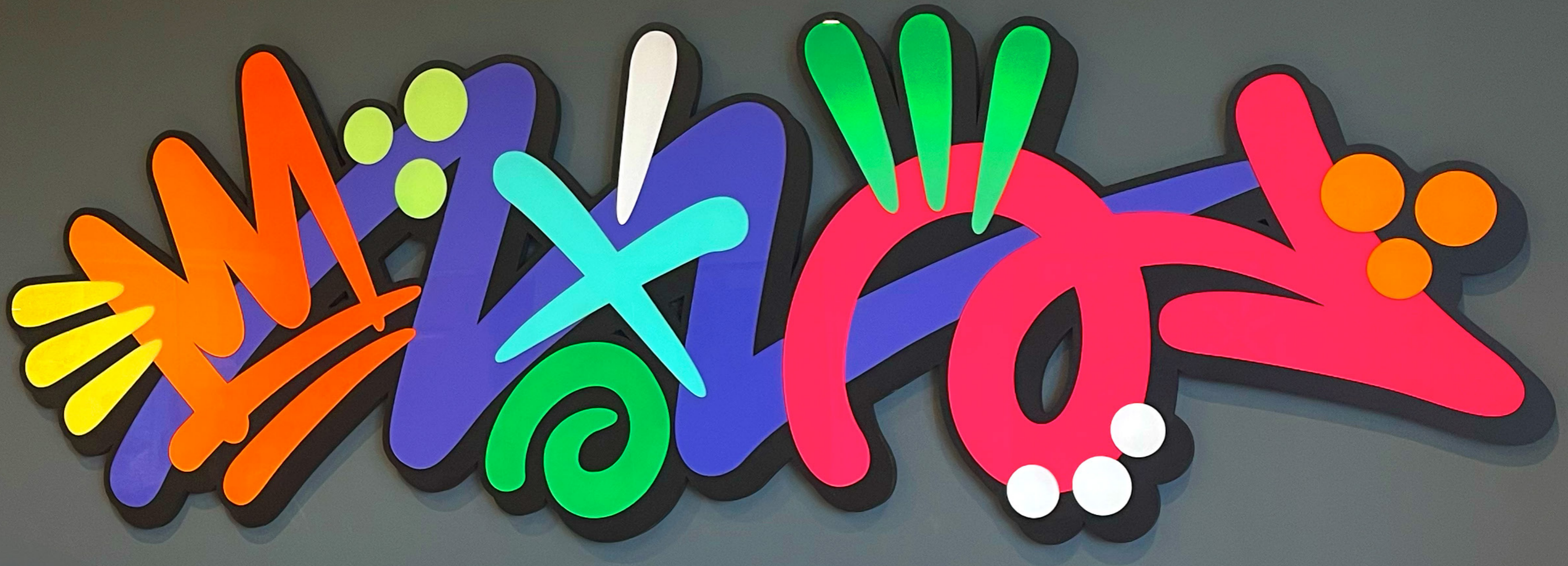
Private Commission Spray Paint on Perspex 90cm x 200cm 2023